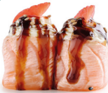
GIO FRUIT 6,90€

Salmon carpaccio, white sushi rice, philcream, teriyaki sauce, strawberry and tenkasu 1,4,6,7