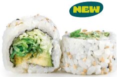
VEGGIE GOURMET 10,00€

IN / Avocado, philacream, iceberg lettuce, wakame seaweed, courgette flower OUT / Sesame 1,3,7,11