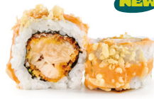
CHICKEN MAKI 10,90€

IN / Fried chicken, lime mayo, iceberg lettuce OUT / Tenkasu and spicy mayo 1,3,11