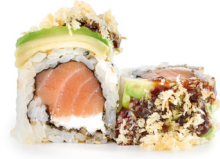
GREEN SALMON 10,90€

IN / Salmon tartare, avocado, philacream OUT / Salmon carpaccio, crispy onion, spicy mayo and teriyaki sauce 1,3,4,6,7,11