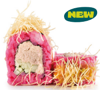
PINK MANGO 11,50€

IN / Shrimp Tempura OUT / Strawberries, philacream, teriyaki sauce and sesame 1,2,6,7,10,12