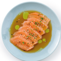
SALMON CARPACCIO (5pcs) 9,00€

Beef tartare seasoned with soy, extra virgin olive oil, salt and pepper, avocado cream and courgette flower in tempura 1,3,6