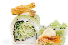
BLOSSOM MAKI 9,00€

IN / Avocado, philacream, iceberg lettuce, wakame seaweed, courgette flower OUT / Sesame 1,3,7,11