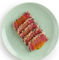
TATAKI TUNA (5pcs) 10,90€

Seared tuna sashimi, ponzu sauce and extra virgin olive oil, yuzu miso and sesame 4,6,11