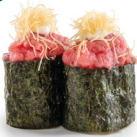
BEEF TARTARE 5,50€

Piedmontese beef tartare, nori seaweed, mayo and kataifi pasta 1,3,6,11