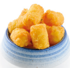
POP POTATOES 5,00€

Shrimp Popscorn, Spicy Mayo Sauce and Chives 1,2,3,4,6