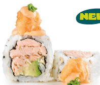
POP COOKED 10,90€

IN / Cooked salmon, avocado, philacream OUT / Pop shrimp, spicy mayo and sesame 12,3,4,7,11