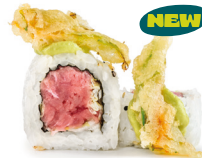
BEEF MAKI 11,50€

IN / Fried chicken, lime mayo, iceberg lettuce OUT / Tenkasu and spicy mayo 1,3,11