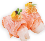
BABY SHRIMP (2pcs) 4,50€

Salmon, philacream, pistachio crumble, tempura courgette flower and teriyaki sauce 1,3,4,6,7,8