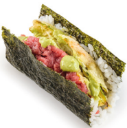
BEEF TARTARE 5,50€

Nori seaweed, sushi white rice, sesame, Piedmontese beef tartare, avocado cream, tempura courgette flowers, yuzu miso sauce 1,3,6,11