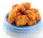
POP CHICKEN 5,90€