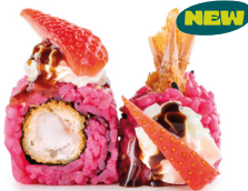
PINK JOE 12,50€

IN / Shrimp Tempura OUT / Strawberries, philacream, teriyaki sauce and sesame 1,2,6,7,10,12