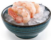
SHRIMP SASHIMI (3pcs) 8,00€

Each dish in this category, in the OpenSushi formula, can be ordered only once per person, from the second order onwards there will be a supplement equal to the price of the à la carte dish.