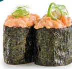
SPICY SALMON 5,50€

Spicy salmon, nori seaweed, white sushi rice and spring onion 3,4,11