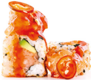
SPICY SALMON 12,50€

IN / Salmon tartare, avocado, philacream OUT / Philacream, nachos, jalapeño, spicy mayo, sriracha sauce and teriyaki sauce 1,3,4,6,7,11