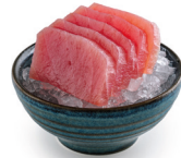
TUNA SASHIMI (5pcs) 9,90€