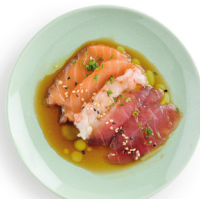
CARPACCIO MIX (5pcs) 9,00€

Salmon, ponzu sauce and extra virgin olive oil, sesame and chives 4,6,11