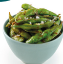
EDAMAME SPICY 4,50€

Edamame, coarse salt, wasabi and yuzu dressing 6