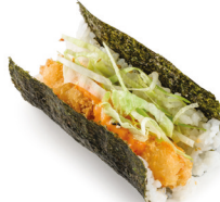
EBI FRIED 6,00€

Nori seaweed, white sushi rice, sesame, salmon fillet, iceberg, goma wakame, fried potato julienne and teriyaki sauce 3,4,6,11