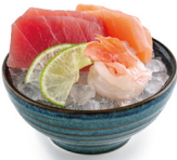
SASHIMI MIX (4pcs) 11,90€

Salmon sashimi (1pc), tuna (1pc), shrimp (2pcs) 2,4