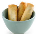
PRAWN SPRING ROLLS (3pcs) 5,00€