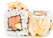
ALMOND TARTARE 11,90€

IN / Salmon fillet, avocado OUT / Sesame 4,11