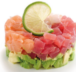
TARTARE MIX 13,90€

Salmon sashimi (1pc), tuna (1pc), shrimp (2pcs) 2,4