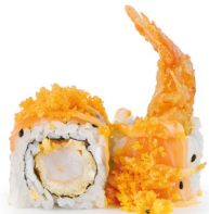
EL GRINGO 13,00€

IN / Salmon fillet, avocado OUT / Seared salmon carpaccio, mayo miso sauce and yuzu miso sauce 3,4,11