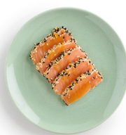
TATAKI SALMON (5pcs) 11,50€

Seared tuna sashimi, ponzu sauce and extra virgin olive oil, yuzu miso and sesame 4,6,11