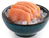
SALMON SASHIMI (5pcs) 9,90€