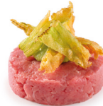
BEEF TARTARE 8,90€

Tuna tartare, wasabi and yuzu dressing 4,6