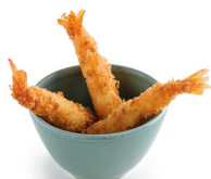
SHRIMP TEMPURA (3pcs) 5,90€

Salmon carpaccio, philacream, teriyaki sauce, spicy mayo, jalapeño, tenkasu and avocado 1,3,4,6,7