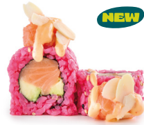
PINK ALMOND 12,90€

IN / Tuna in oil, cucumber OUT / Mango sauce and kataifi paste 1,4,6,11