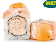
NEW LIMA 9,90€

IN / Tonno sott'olio, mayo OUT / Carpaccio di salmone scottato e spicy mayo 3,4,11